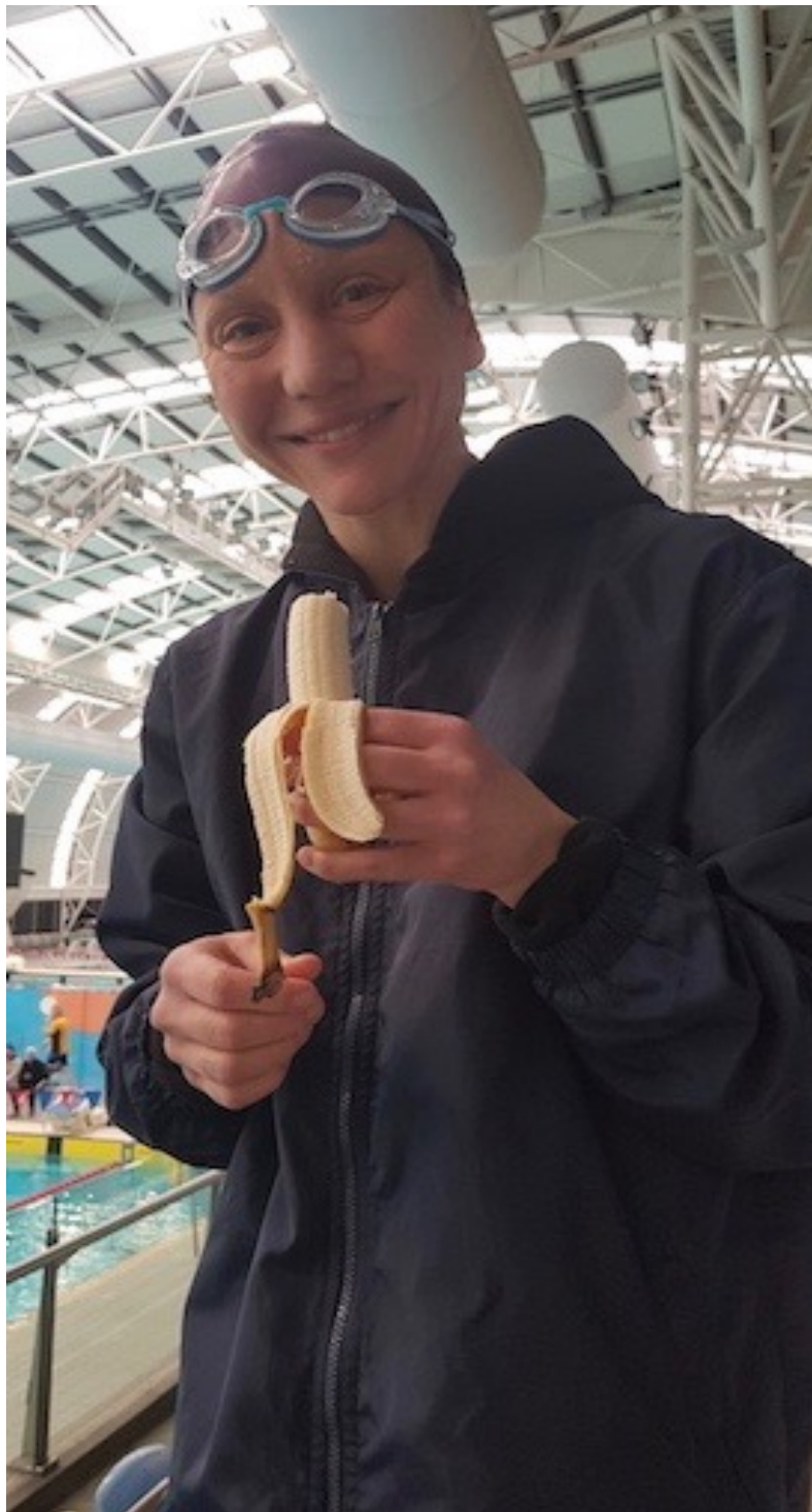
Bec showed her versatility by swimming 3 different strokes over 3 different distances, and being great in all of them!